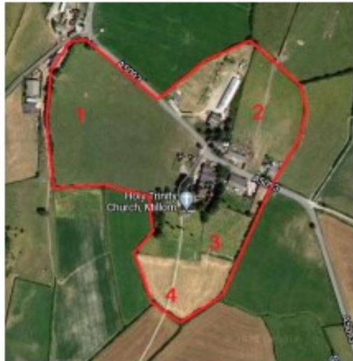
Area to be Surveyed