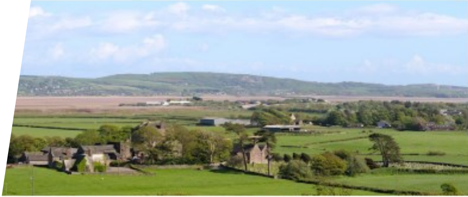
View of Old School, Millom Castle and Holy Trinity Church, from The Knott