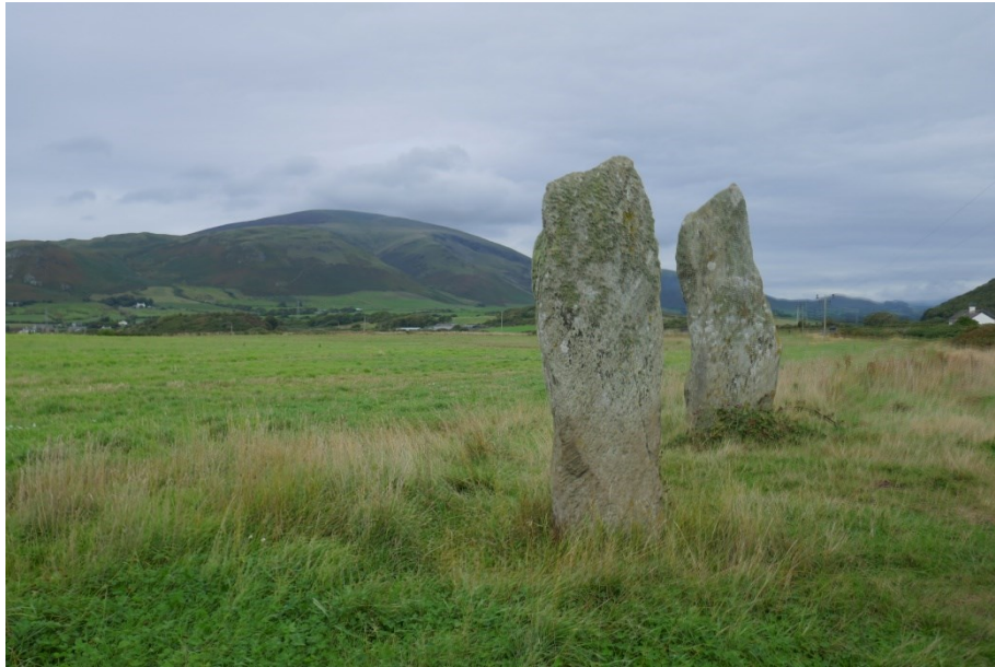
Giant's Grave, Kirksanton

One is about three metres high whilst the other is around two and a half metres; they are separated by four and a half metres and are situated between the coast and Lacro Bank.