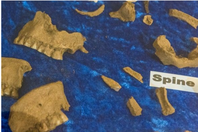
Hodbarrow Point Bones (Millom Heritage and Arts Centre)