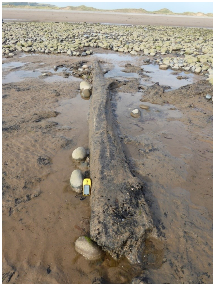
Part of sunken 'forest' off Haverigg Point (Stephe Cove)