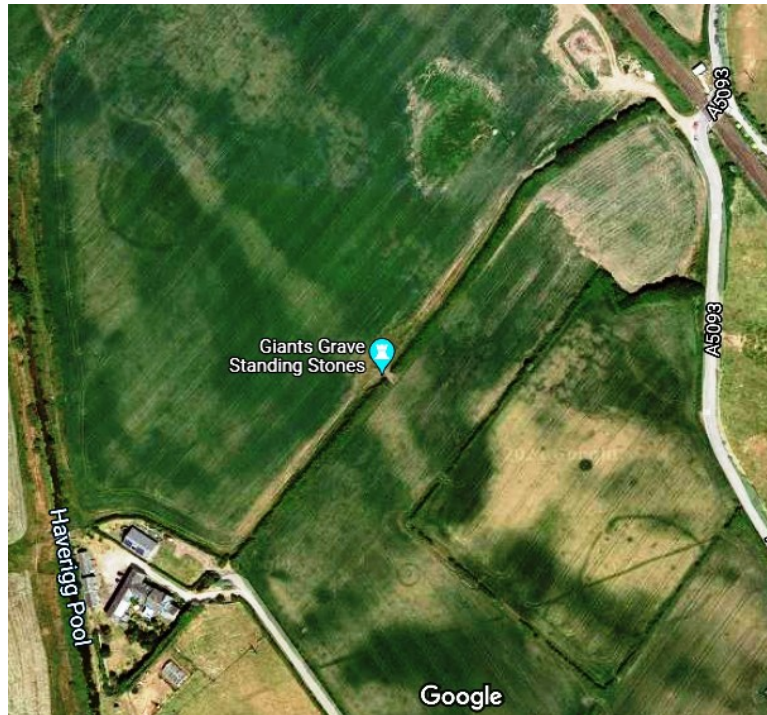
Google Aerial: Giant's Grave (4)

Here is another screen shot of the northern one: