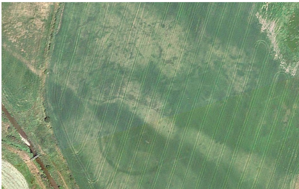
Google Aerial: Giant's Grave (5)

Here is another screen shot of the northern one: