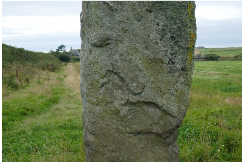
One of Giant's Grave Standing Stones, Kirksanton

Blackcombe lies to the north whilst Lacra Bank, and its numerous funerary stone monuments, is to the east. It is suggested vi that as the two stones are aligned southwest-northeast, and their narrow edges point towards Whicham Beck Valley between Blackcombe and Lacra Bank, that they represent a safe route between the hills; or they could be an ancient sign post pointing in the direction of something else, maybe Swinside or Po House, where, nearby, there is part of a standing stone whose fabric is similar to that of the standing stones of Giant's Grave at Kirksanton: it has the same crystalline quartz banding. vii It only stands 1.5m high, and some distance behind it is a natural spring which is marked by a flat cup marked slab. viii Po House is, of course, not too far from Lacra Bank; it is also worth noting that quern stones have been found at Po House.