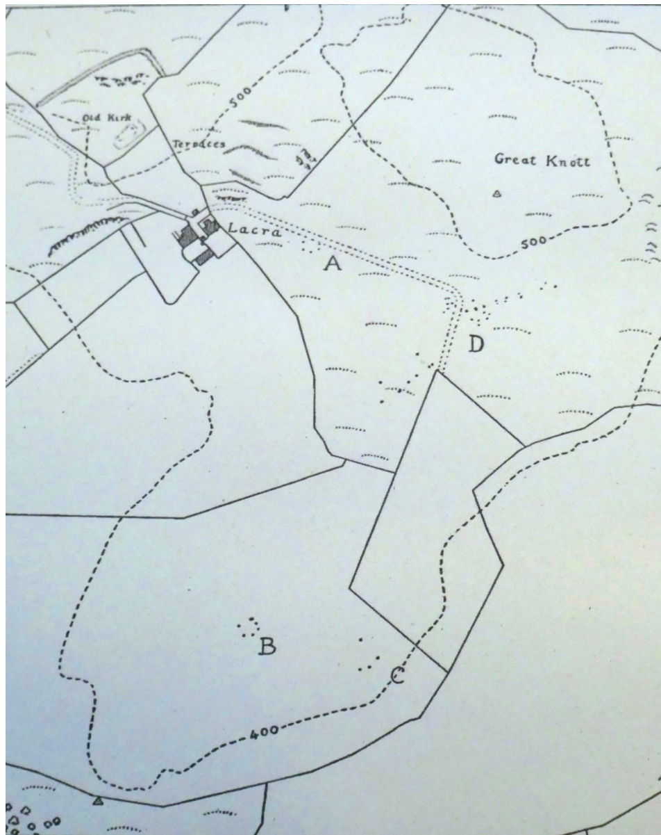
Lacra Diagram, Transactions, Vol 48, 1948

found on the other side of the hill: park near Po House and follow the old track. xiv