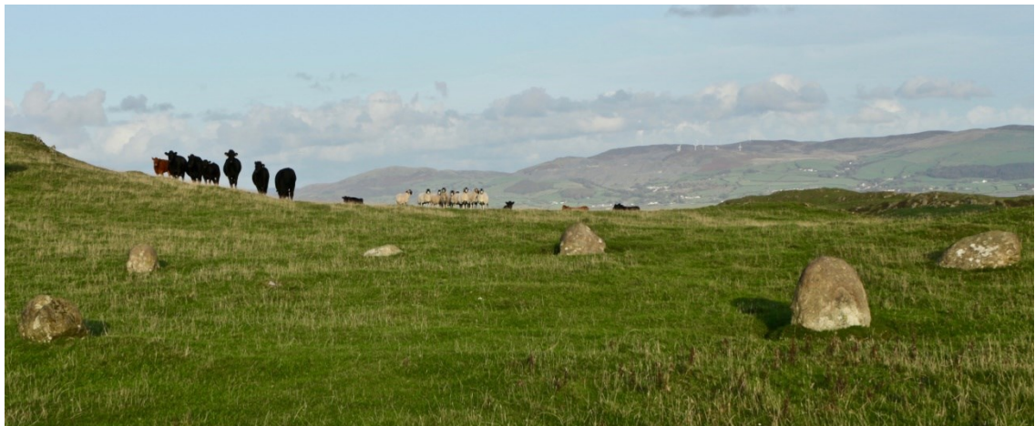
Lacra B (Jem Freisesleben) xii

The site has been used over many different periods and is believed to have been specifically created to carry out funerals. It is suggested xi that there is also a rare stone avenue which, like the circles, possibly aligns towards the solstice sun. Stone avenues were perhaps an Early Bronze Age equivalent of the Neolithic cursus, implying they may have been used for processions.